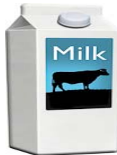
Semi Skimmed Milk