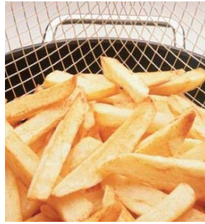
Deep Fat Fried