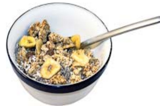
Cereal without sugar